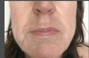
AFTER ONE VENUS VERSA™ SESSION